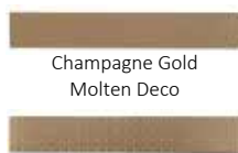
Champagne Gold Molten Deco