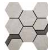
Nickel Plate w/ Iron