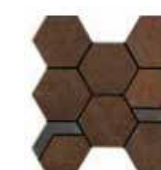
Copper Deposit w/ Iron