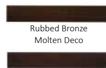
Rubbed Bronze Molten Deco