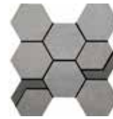
Crucible Steel w/ Iron