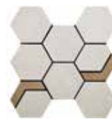
Noble Platinum w/ Gold