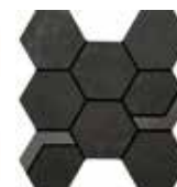
Graphite Black w/ Iron