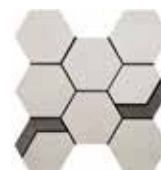
Noble Platinum w/ Iron