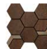
Copper Deposit w/ Gold