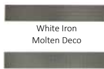
White Iron Molten Deco