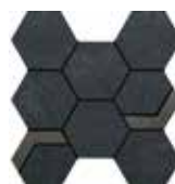
Cobalt Ore w/ Iron